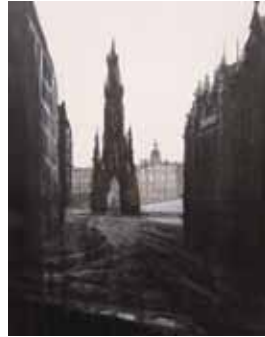
Wintry afternoon looking towards Scott Monument 31cm x 24cm, Indian ink on paper