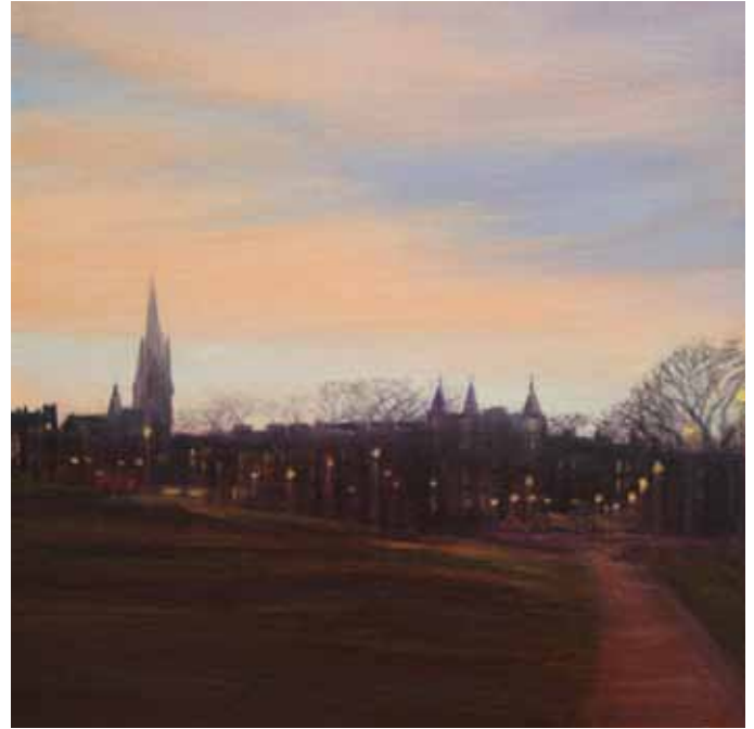
Winter clouds in The Meadows 30cm x 30cm, Oil on linen