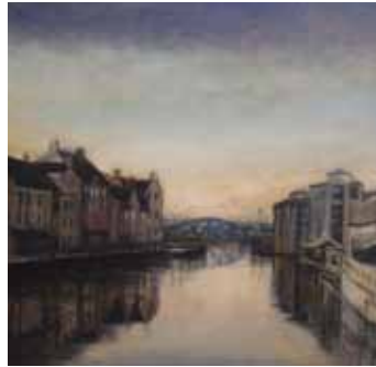
Still waters in Leith 30cm x 30cm, Oil on linen