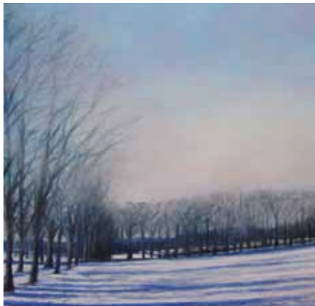
Snow patterns in Inverleith Park 30cm x 30cm, Oil on board