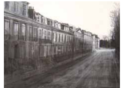
Heriot Row looking towards Abercromby Place 24cm x 31cm, Indian ink on paper