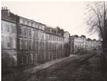
Drummond Place 24cm x 31cm, Indian ink on paper