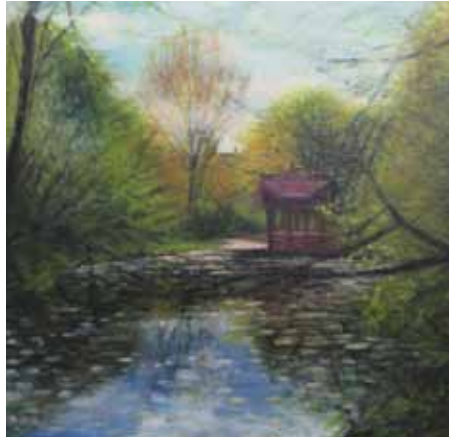
Chinese Garden 30cm x 30cm, Oil on linen