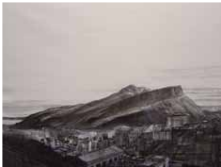
Arthur's Seat from Calton Hill 47cm x 63cm, Indian ink on paper