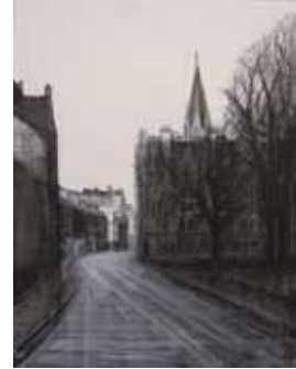
Winter shadows over Bruntsfield 31cm x 24cm, Indian ink on paper