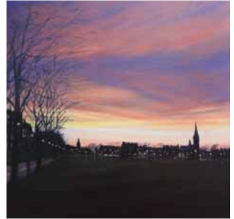
Winter light in Bruntsfield 40cm x 40cm, Oil on linen