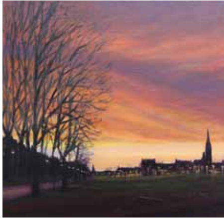
Winter skies over Bruntsfield 30cm x 30cm, Oil on linen