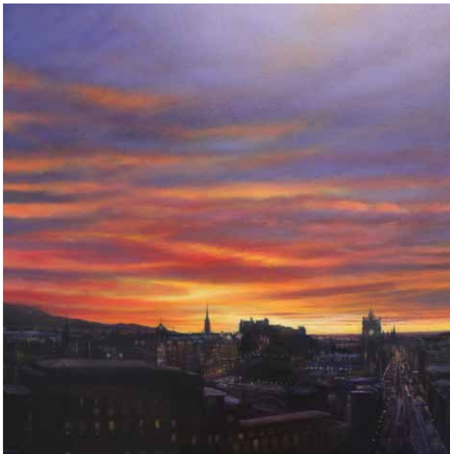
Winter sunset from Calton Hill 100cm x 100cm, Oil on canvas