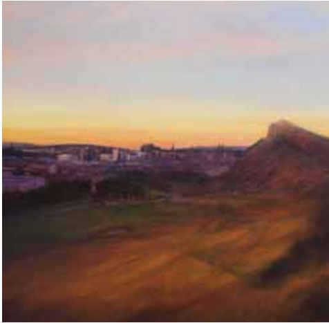
Winter shadows over the city 60cm x 60cm, Oil on canvas