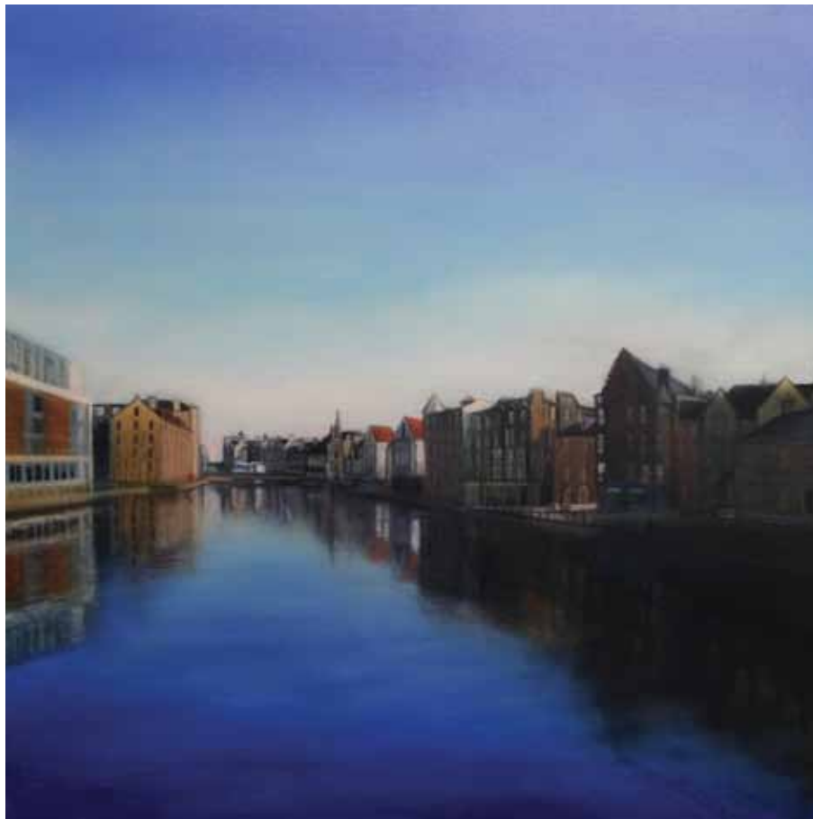
Early morning in Leith 80cm x 80cm, Oil on canvas