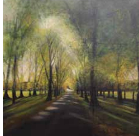
Autumnal light on Middle Meadow Walk 50cm x 50cm, Oil on canvas