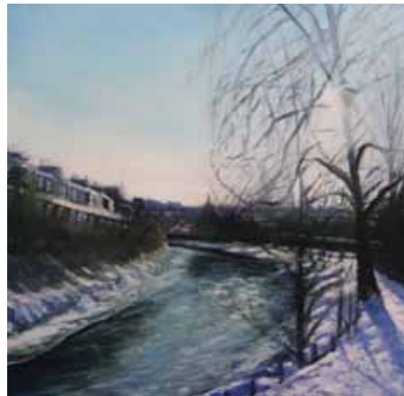
Icy afternoon in The Stockbridge Colonies 30cm x 30cm, Oil on board