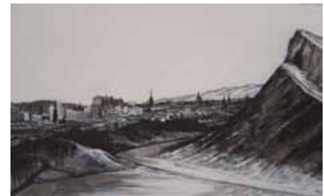
City skyline from Arthur's Seat 30cm x 47cm, Indian ink on paper