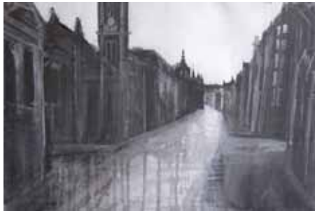
The Royal Mile from The Tron 30cm x 47cm, Indian ink on paper