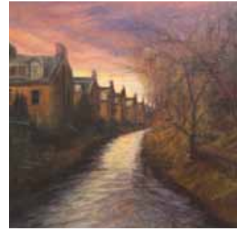
Winter skies over The Colonies 30cm x 30cm, Oil on linen