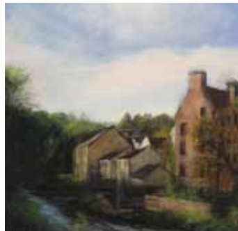
Afternoon shadows in The Dean Village 30cm x 30cm, Oil on board