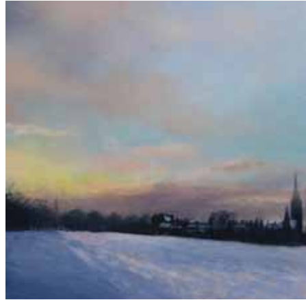
Last light looking towards Bruntsfield 30cm x 30cm, Oil on board