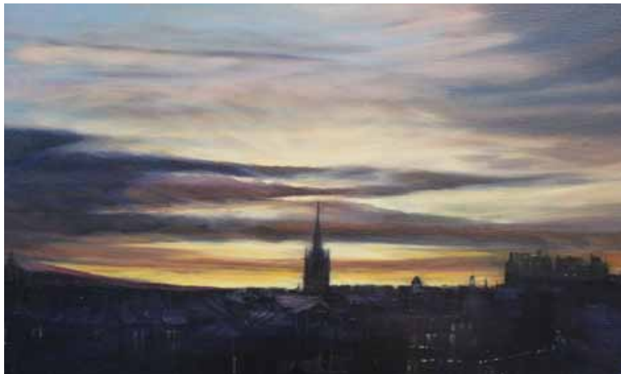
Twilight skies approaching 33cm x 55cm, Oil on linen