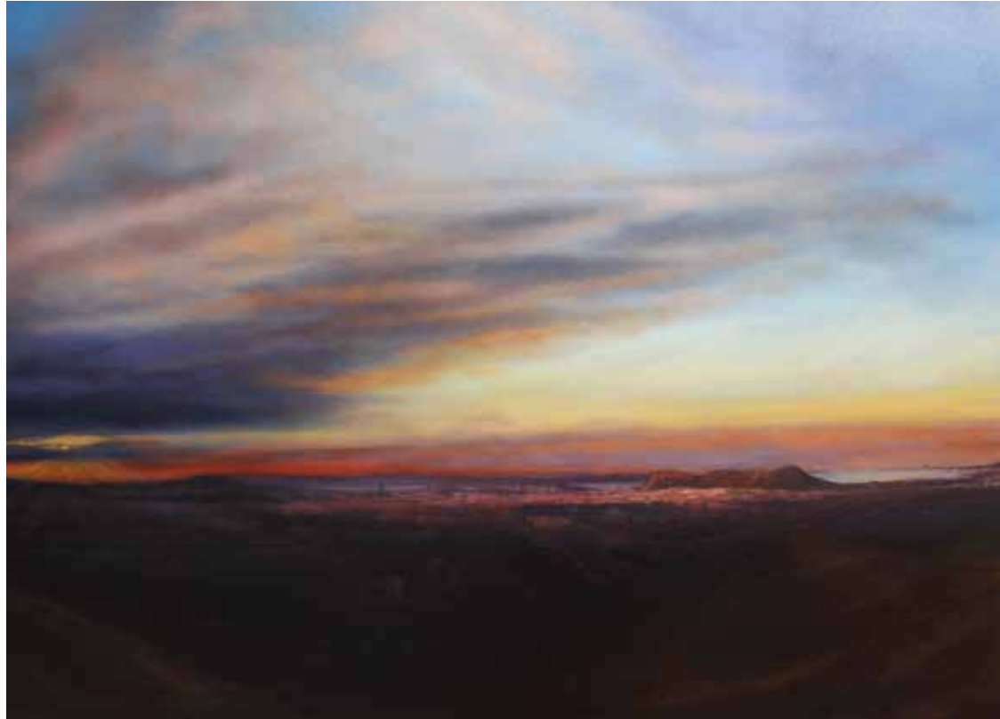
Last light from Blackford Hill 100cm x 140cm, Oil on canvas