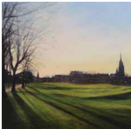
Light shadows on The Meadows 30cm x 30cm, Oil on linen