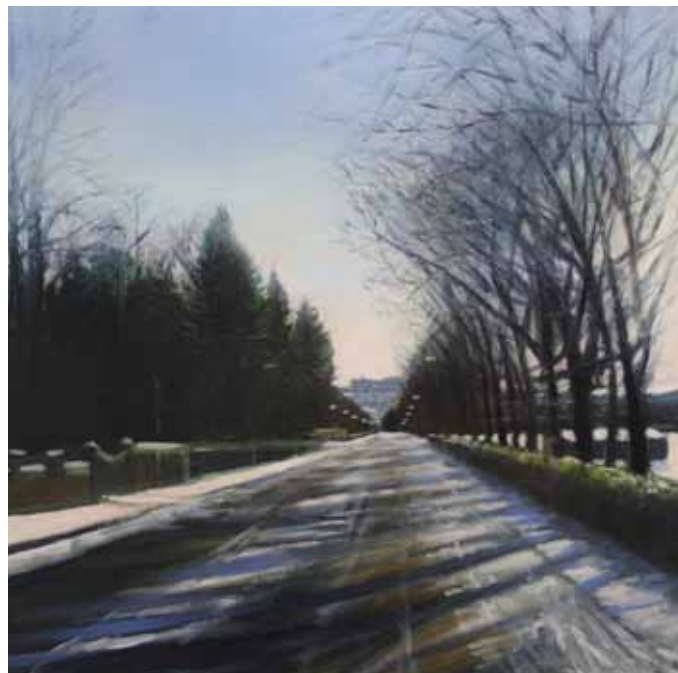
Snow in Inverleith 30cm x 30cm, Oil on board