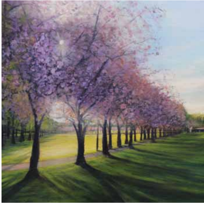
Spring blossom in The Meadows 40cm x 40cm, Oil on linen