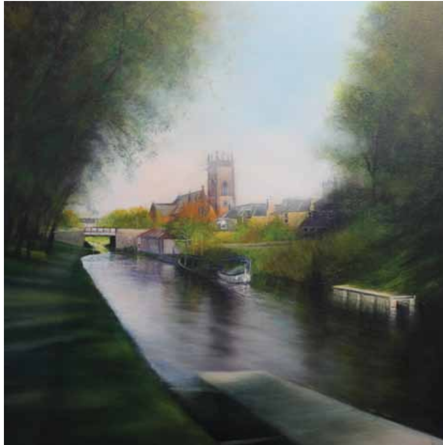
Afternoon light on The Union Canal 80cm x 80cm, Oil on canvas