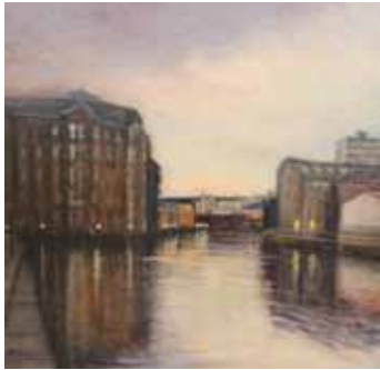
Light breaking over The Shore 30cm x 30cm, Oil on linen