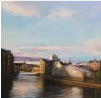
Winter skies over Leith 30cm x 30cm, Oil on linen