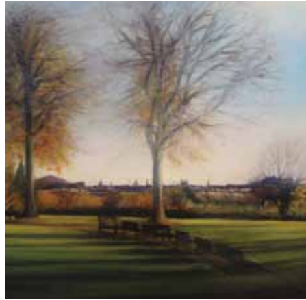
Edinburgh skyline from The Royal Botanic Garden 30cm x 30cm, Oil on linen