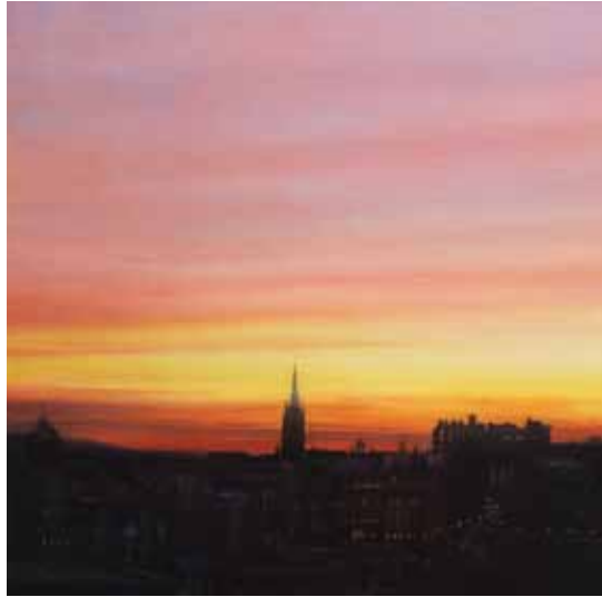
Twilight approaching 40cm x 40cm, Oil on linen