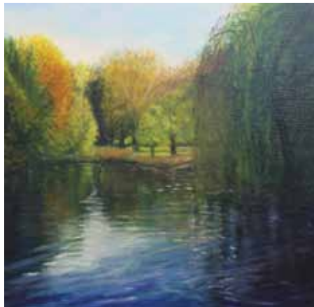
Pond reflections in The Royal Botanic Garden 30cm x 30cm, Oil on linen