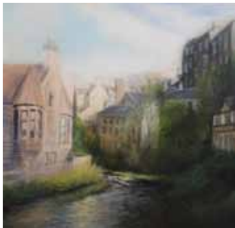
Reflections in The Dean Village 30cm x 30cm, Oil on board