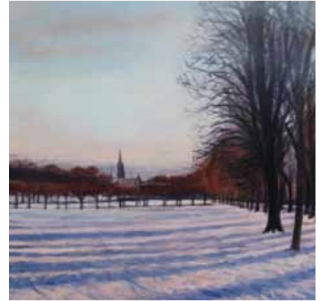
Snow reflections 30cm x 30cm, Oil on board