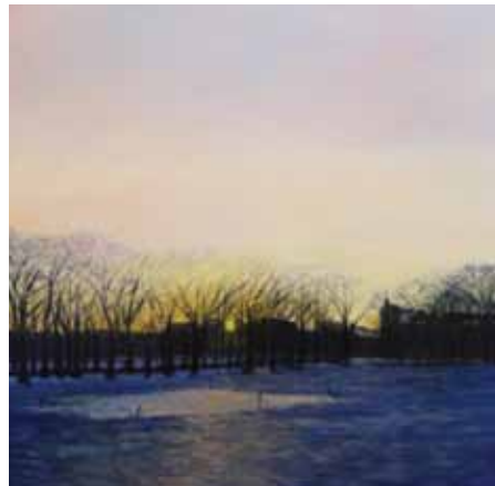
Early morning clouds over Marchmont 30cm x 30cm, Oil on board