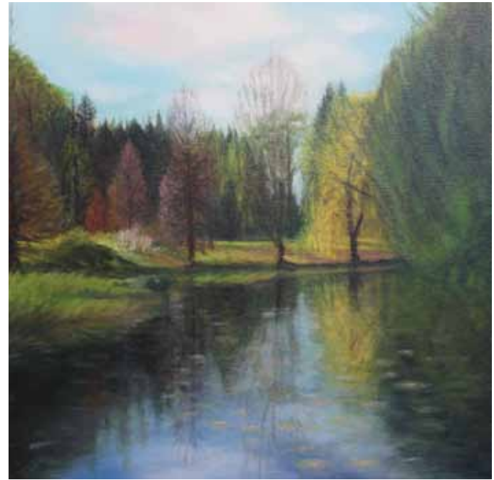
Royal Botanic Garden shimmers 50cm x 50cm, Oil on canvas