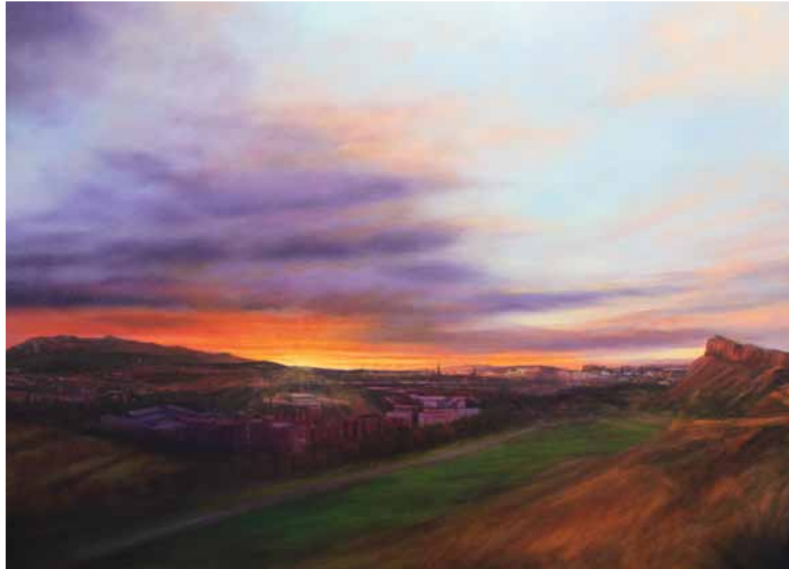
Sunset from Arthur's Seat 100cm x 140cm, Oil on canvas