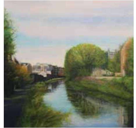
Union Canal reflections 30cm x 30cm, Oil on linen