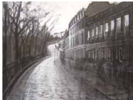
Dean Terrace 24cm x 31cm, Indian ink on paper