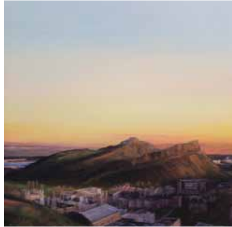
Last light over Arthur's Seat 50cm x 50cm, Oil on linen