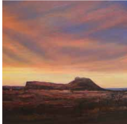
Vivid skyscape from Blackford Hill 30cm x 30cm, Oil on linen