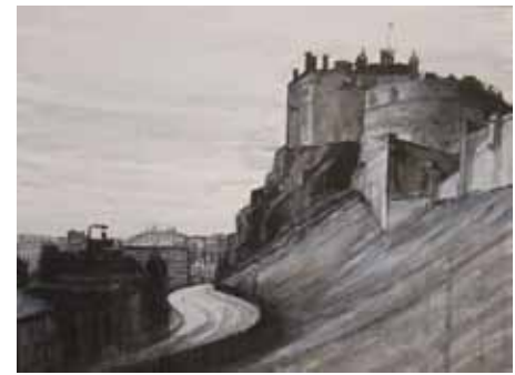
Nightfall on the castle from Johnston Terrace 24cm x 31cm, Indian ink on paper