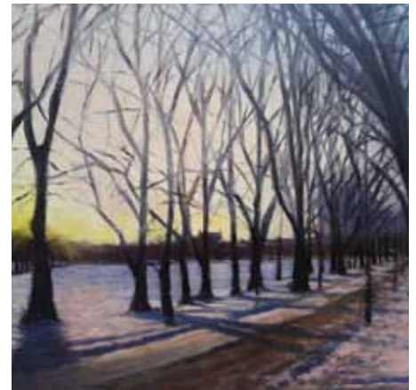
Winter on Middle Meadows Walk 30cm x 30cm, Oil on board