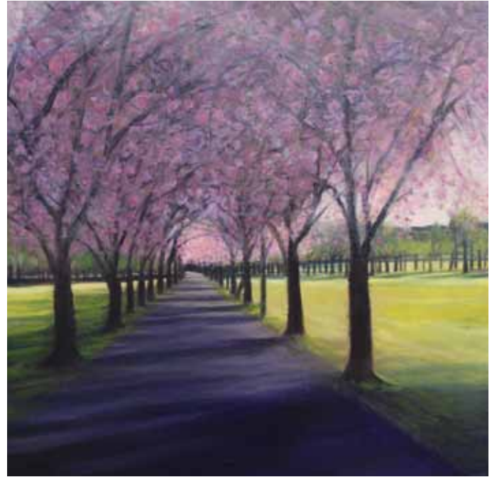
Meadows Spring reflections 40cm x 40cm, Oil on linen