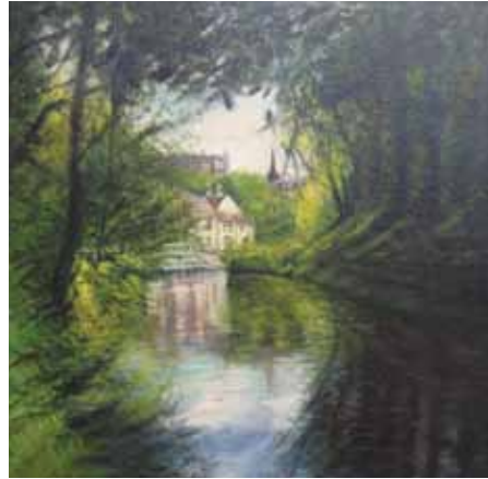
Late afternoon on The Water of Leith 30cm x 30cm, Oil on linen