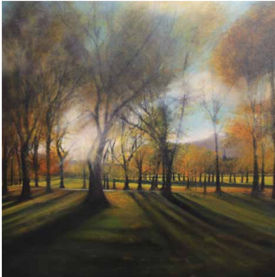
Autumnal reflections in The Meadows 80cm x 80cm, Oil on canvas