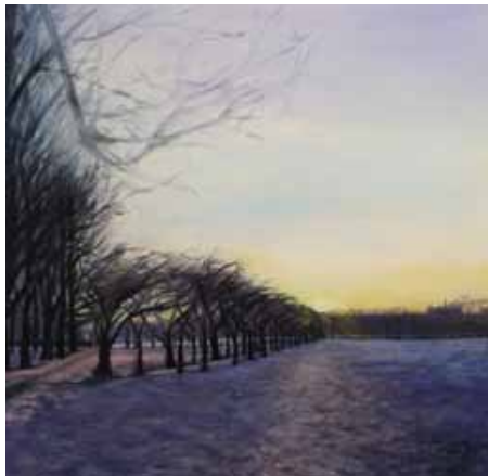
Sunrise on The Meadows 30cm x 30cm, Oil on board