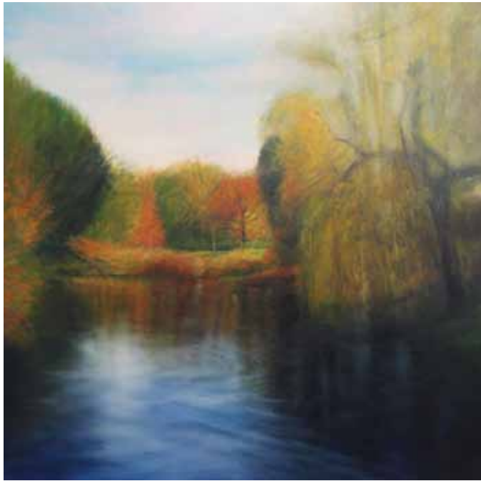
Autumnal pond reflections in The Royal Botanic Garden 80cm x 80cm, Oil on canvas