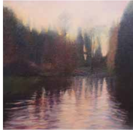
Sunset on The Royal Botanic Garden Pond 30cm x 30cm, Oil on linen