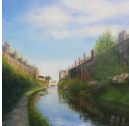
Viewforth shadows 30cm x 30cm, Oil on linen