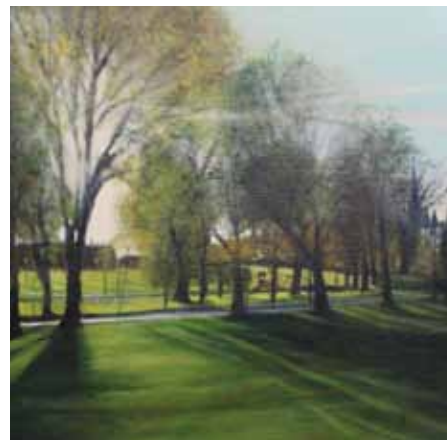
Light reflections on The Meadows 30cm x 30cm, Oil on linen