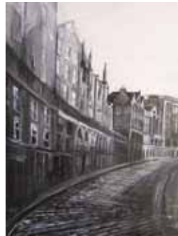
Afternoon shadows on Victoria Street 31cm x 24cm, Indian ink on paper