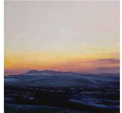
Winter haze over The Pentlands 30cm x 30cm, Oil on linen