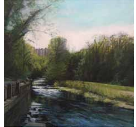
New Town reflections 30cm x 30cm, Oil on linen