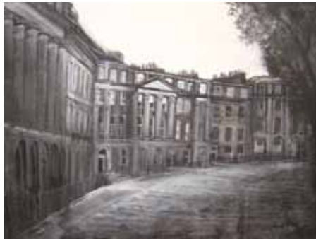
Moray Place 24cm x 31cm, Indian ink on paper