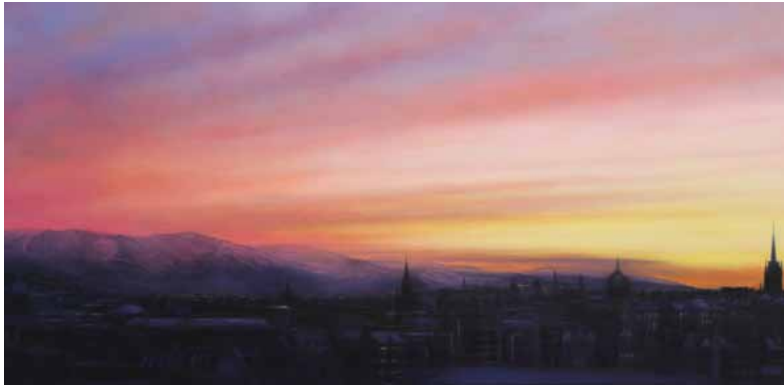
Transient Skies 50cm x 100cm, Oil on canvas