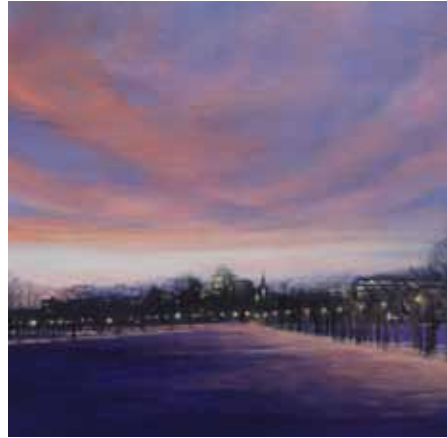
Twilight skies towards Quatermile 30cm x 30cm, Oil on board