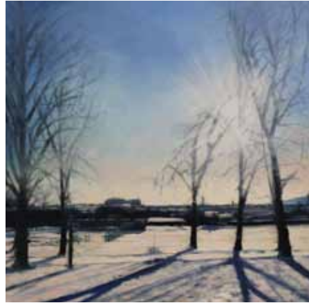
Ethereal afternoon in Inverleith Park 30cm x 30cm, Oil on board