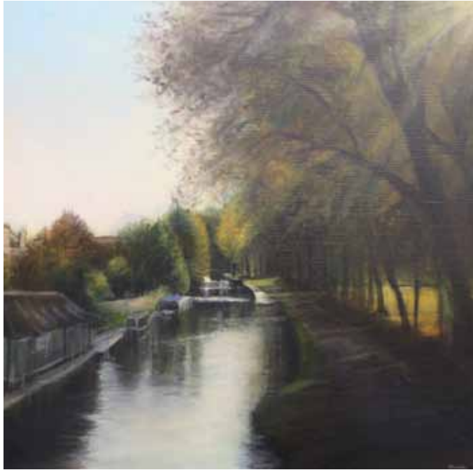
Serene Impressions 50cm x 50cm, Oil on linen