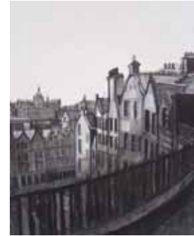
Looking down towards The Grassmarket 31cm x 24cm, Indian ink on paper