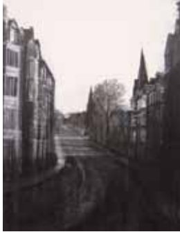
Last light in Bruntsfield 31cm x 24cm, Indian ink on paper