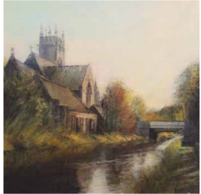
Polwarth Church 30cm x 30cm, Oil on linen