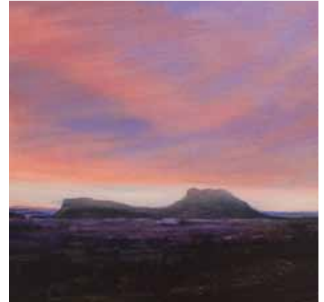
Winter clouds from Blackford Hill 30cm x 30cm, Oil on linen