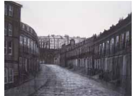
Danube Street 24cm x 31cm, Indian ink on paper