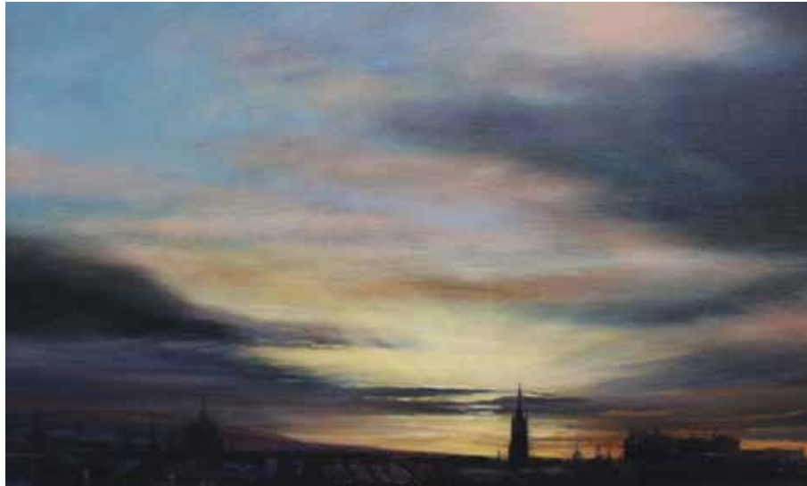
Last burst of light over the city 33cm x 55cm, Oil on linen