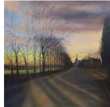
Sun setting over Inverleith Park 50cm x 50cm, Oil on canvas

Although he has travelled extensively in the past and captured destinations further afield in his paintings, Primrose is best known for his Edinburgh artworks – as he is continually inspired by the city he grew up in and where he now lives once again. This extensive major body of work celebrates his passion for the Scottish capital – its unique light and majestic sculptural landscape. It explores his emotional relationship with city locations from his past or present, offering an evocative statement as he captures the transient nature of light from the sky onto land and water. Focusing primarily on autumnal and winter light at its most dramatic – sunrise and sunset, his works evoke a tranquil, ethereal quality as he emphasises luminosity and atmosphere.