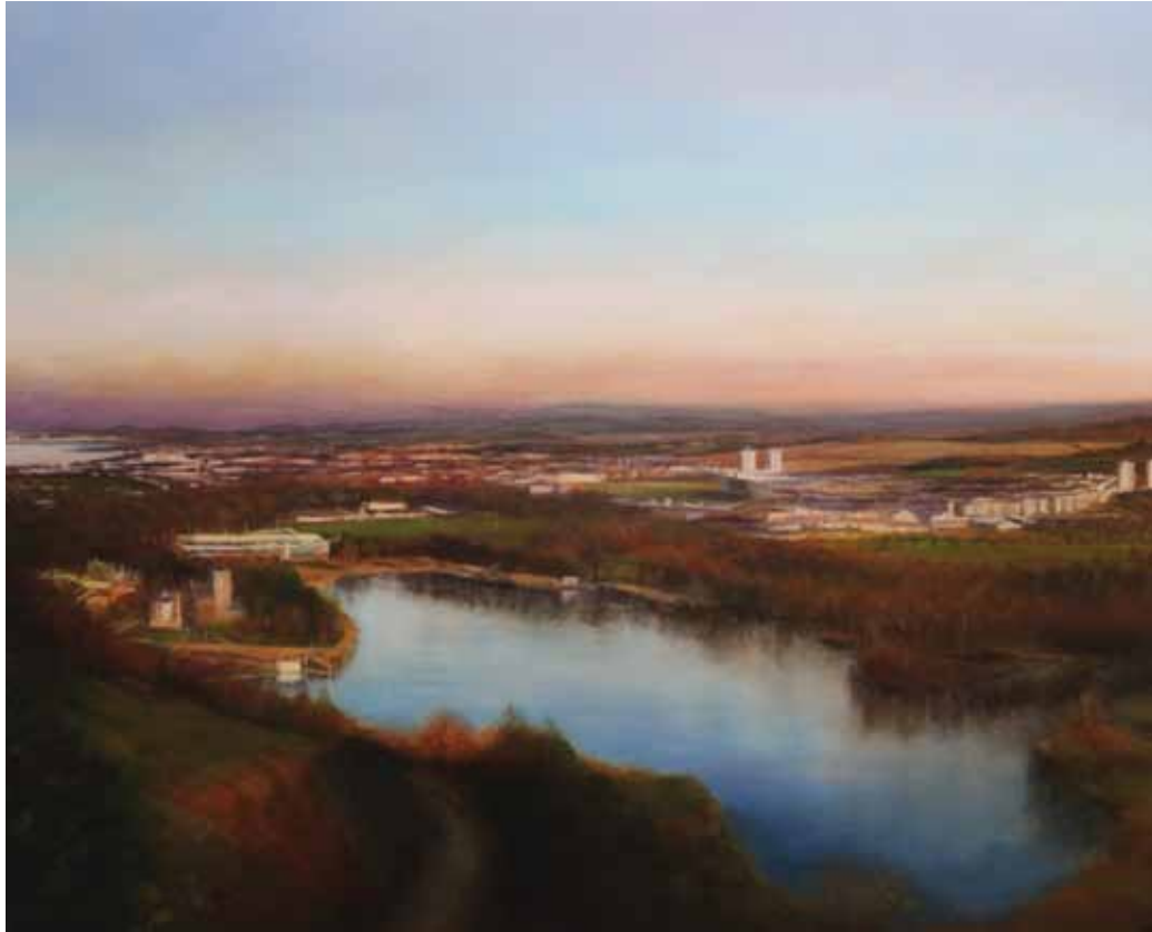
Winter light on Duddingston Loch 80cm x 100cm, Oil on canvas