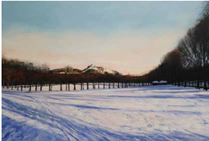
Snow shadows looking towards Arthur's Seat 30cm x 60cm, Oil on canvas