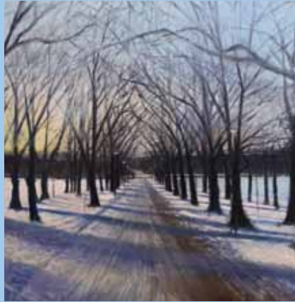
Winter afternoon on Middle Meadow Walk 50cm x 50cm, Oil on board