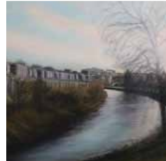
Light falling on The Water of Leith 50cm x 50cm, Oil on board