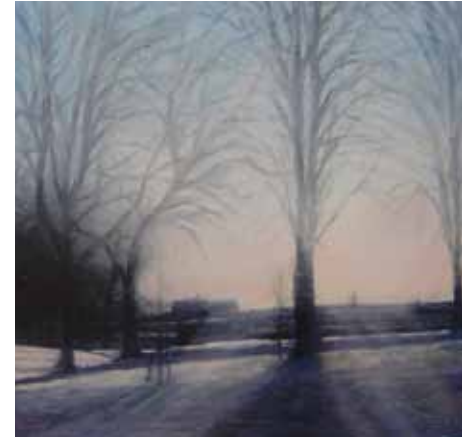
Streams of light in Inverleith Park 30cm x 30cm, Oil on board