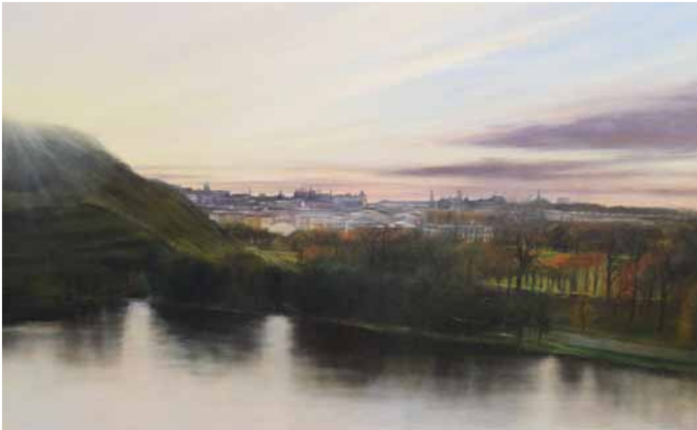
Sunset over St. Margaret's Loch 60cm x 80cm, Oil on canvas