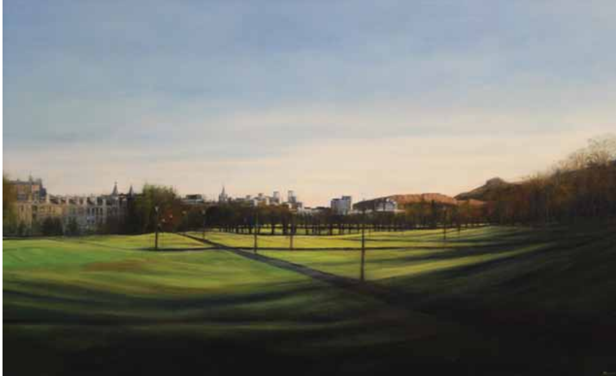
Evolving Moods 60cm x 10cm, Oil on canvas