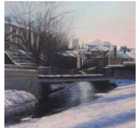
Late afternoon in Stockbridge 30cm x 30cm, Oil on board