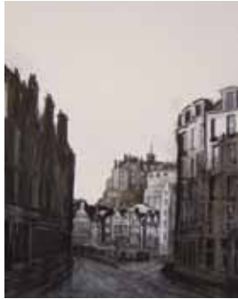
Late afternoon looking towards The Grassmarket 31cm x 24cm, Indian ink on paper