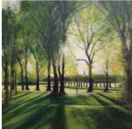
Ethereal light through The Meadows 30cm x 30cm, Oil on linen