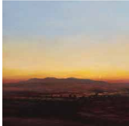
Last light over The Pentlands 30cm x 30cm, Oil on linen