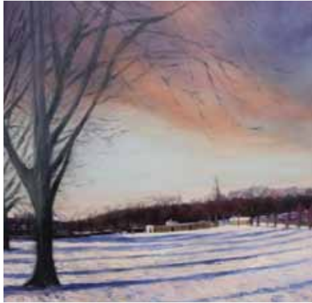
Winter overlooking Inverleith Park 30cm x 30cm, Oil on board