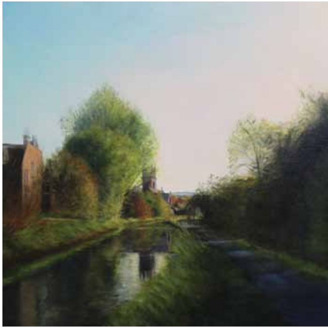
Late afternoon at Polwarth 40cm x 40cm, Oil on linen