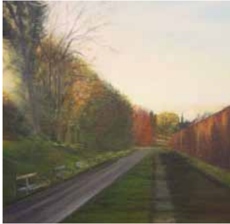
Autumn in The Royal Botanic Garden 30cm x 30cm, Oil on linen