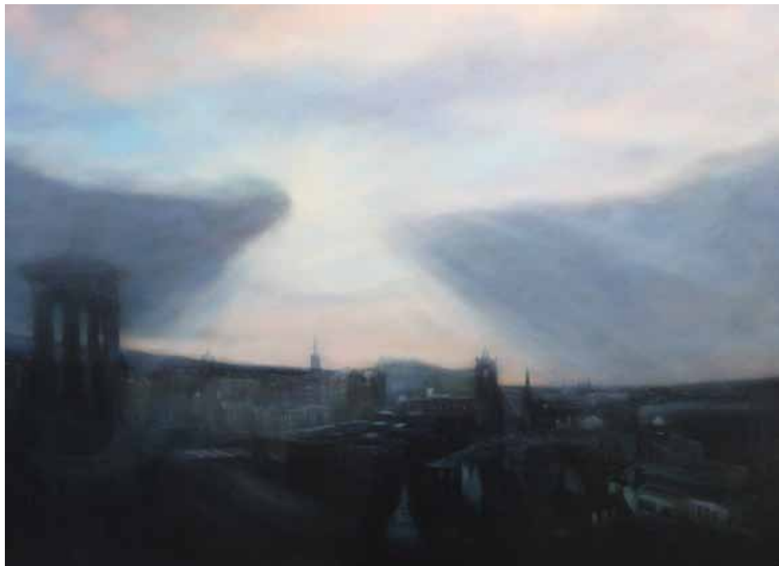
Streams of light over Edinburgh 100cm x 140cm, Oil on canvas