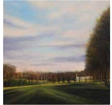
Autumn shadows in Inverleith Park 30cm x 30cm, Oil on linen