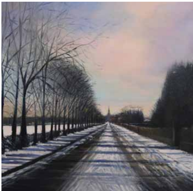
Snow clouds on Inverleith Place 50cm x 50cm, Oil on board