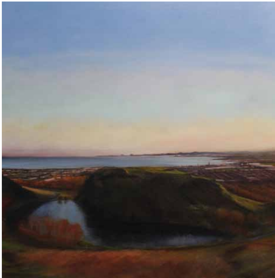
Late autumn afternoon over Dunsapie Loch 80cm x 80cm, Oil on canvas