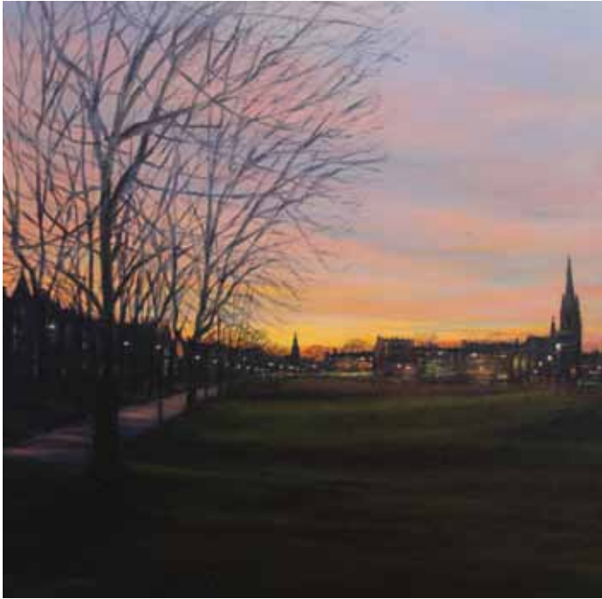
Winter skies over The Meadows 50cm x 50cm, Oil on canvas