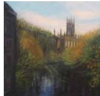
Autumn reflections 30cm x 30cm, Oil on board