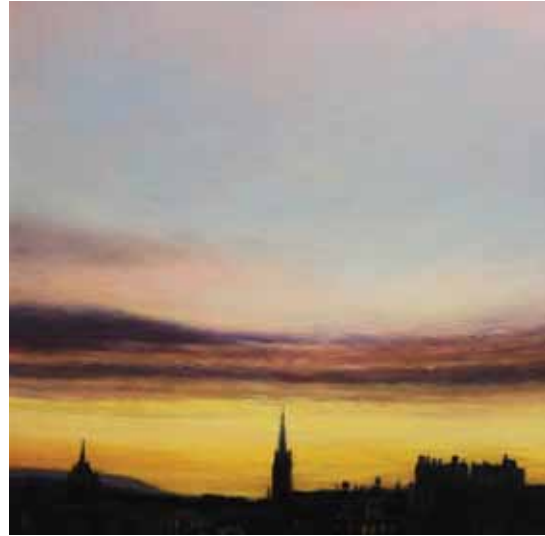
Sunset over the castle 30cm x 30cm, Oil on linen