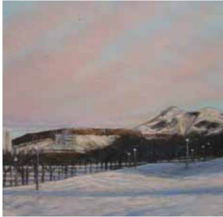
Snow on Arthur's Seat 30cm x 30cm, Oil on board