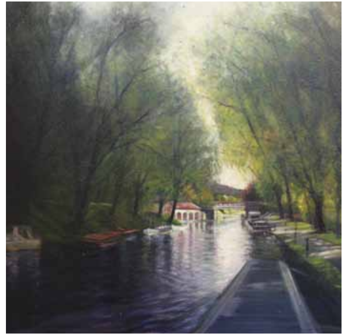
Polwarth reflections 50cm x 50cm, Oil on linen