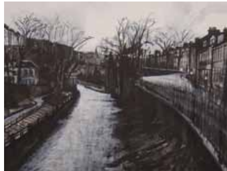
Twilight over St. Bernard's Well 24cm x 31cm, Indian ink on paper