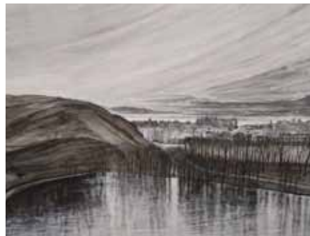
Winter reflections on St. Margaret's Loch 47cm x 63cm, Indian ink on paper