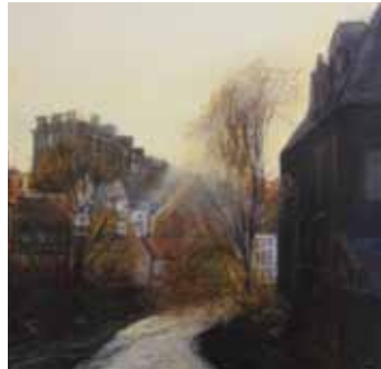
Late afternoon in The Dean Village 30cm x 30cm, Oil on board