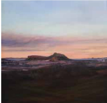
Edinburgh skyline from Blackford Hill 60cm x 60cm, Oil on canvas