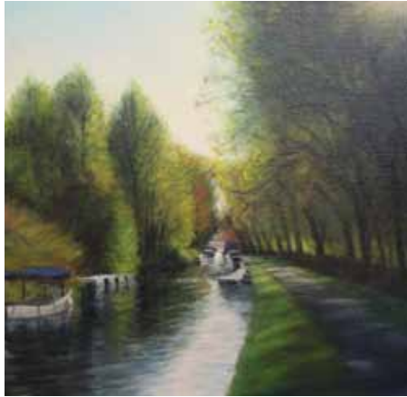
Late afternoon reflections 30cm x 30cm, Oil on linen