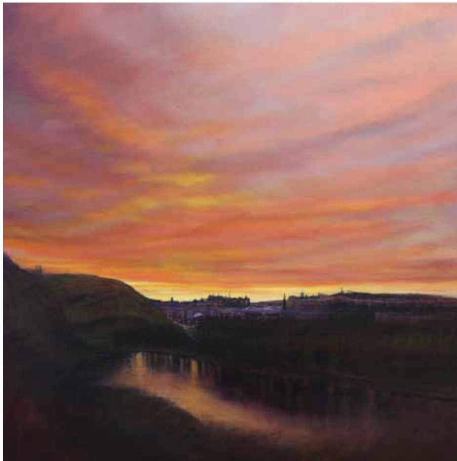
Winter sunset over St. Margaret's Loch 100cm x 100cm, Oil on canvas