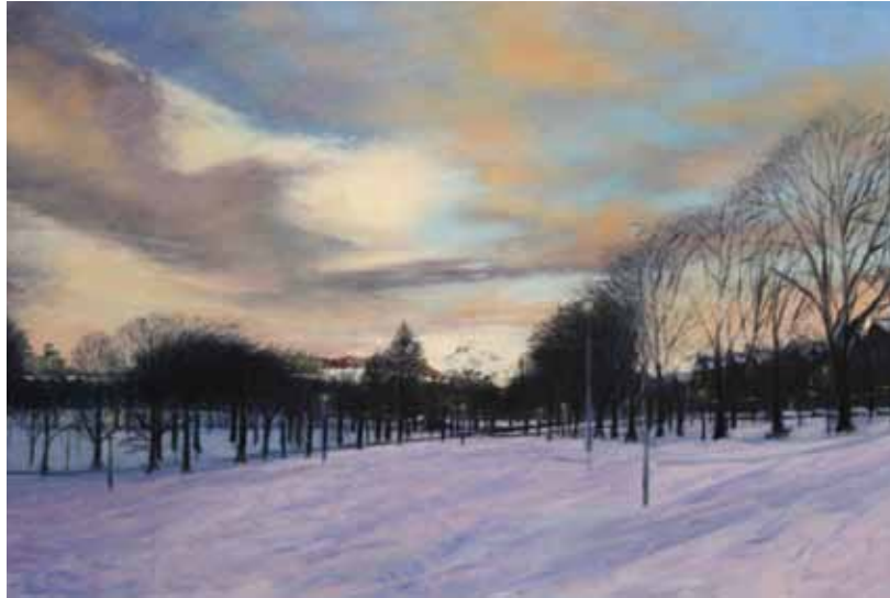
Snow clouds over The Meadows 30cm x 60cm, Oil on canvas