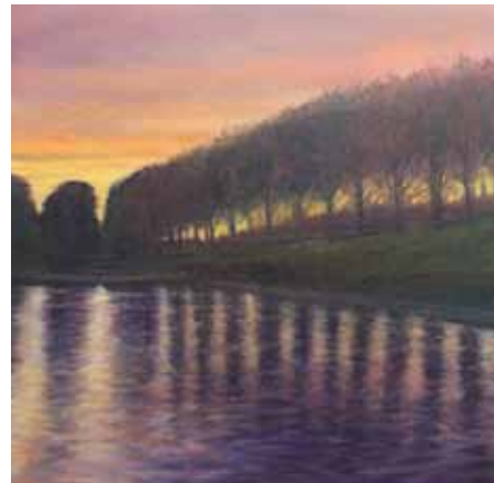
Sunset on Inverleith Pond 50cm x 50cm, Oil on canvas