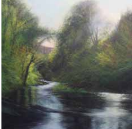
Light and shade on The Water of Leith 50cm x 50cm, Oil on canvas