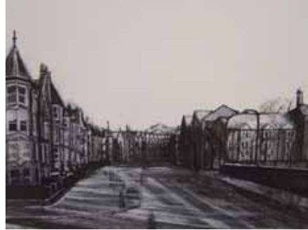
Afternoon shadows in Warrender Park Road 24cm x 31cm, Indian ink on paper